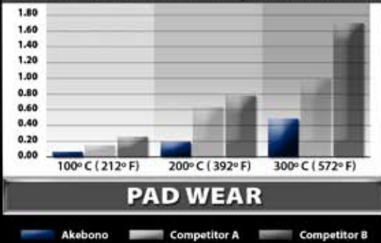
Pro-ACT delivers over 73% less pad wear at 100° C

When installing Akebono Pro-ACT Ultra-Premium brake pads, customers will receive OE-quality replacements. Akebono knows the precise definition of OE-quality by the Original Equipment Manufacturers, as Akebono bids on all vehicle platforms and model years in North America.