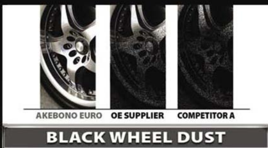
After 400 Stops

Akebono knows that owners of European vehicles have a particular passion for the performance standards and design aesthetics that are unique to European makes. Most drivers of European vehicles seek a driving experience using vehicle-handling techniques that are focused almost entirely on braking. This driving style is unforgiving on brake pads, making quality the critical decision point.